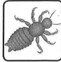
Full Grown Louse